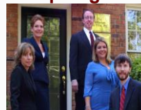
The Gartzman Law Firm Team!