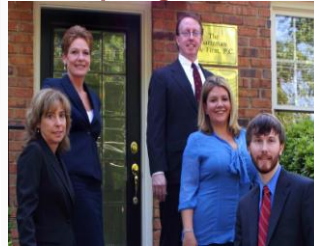
The Gartzman Law Firm Team!